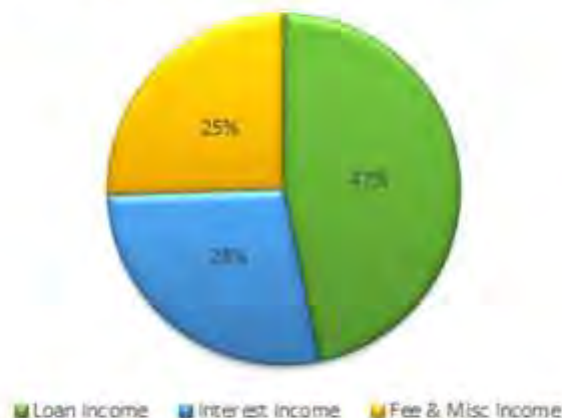
2024 GCFCU Total Gross Income

The pie chart shows the impact member borrowing has on the credit union's income. Loans account for 47% of our total income which is then returned to our members in the form of lower loan rates, dividends on savings, and outstanding products and services! The credit union continues to provide a safe, convenient place to save and borrow with competitive rates and personal service suited toward your specific needs.