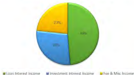
2025 GCFCU Total Gross Income

The pie chart shows the impact member borrowing has on the credit union's income. Loans account for 49% of our total income which is then returned to our members in the form of lower loan rates, dividends on savings, and outstanding products and services! The credit union continues to provide a safe, convenient place to save and borrow with competitive rates and personal service suited toward your specific needs.